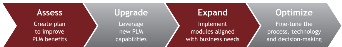
Figure 3: Framework for Evolving PLM

Companies taking a strategic, evolutionary approach to PLM are the most successful in generating returns on their program investments. Best-in-class companies evolving their PLM solutions are delivering significant top- and bottom-line benefits, and, more importantly, they are outperforming their peers that are taking a more tactical approach.