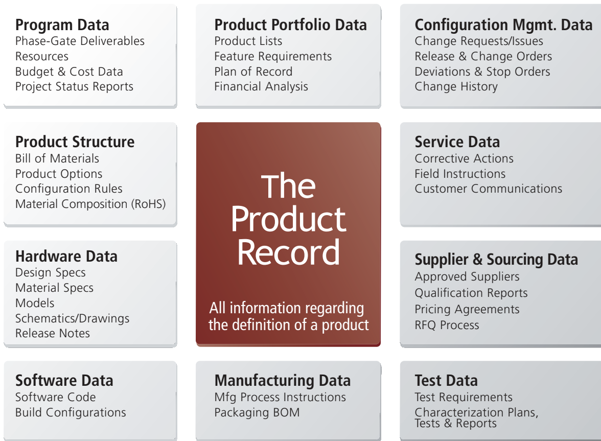
Figure 2: The Product Data Record

As shown in Figure 2, this data model is called the Product Data Record (PDR). The PDR is the heart of PLM—the blueprint to guide a company’s PLM initiative by providing a comprehensive view of all product data elements, both structured and unstructured.